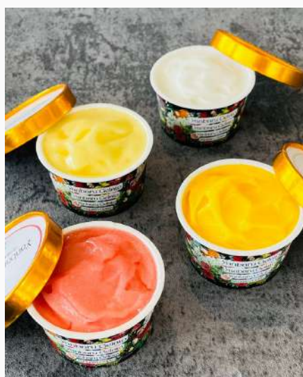
Yambaru Gelato ¥750

A special set of soup of the day. Soup by itself is 500 yen.