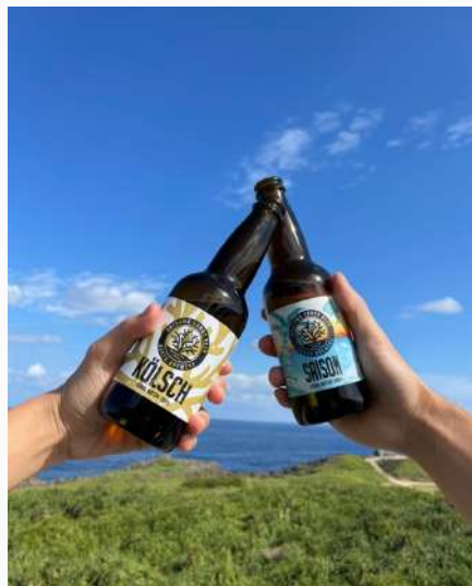
Okinawa Craft Beer ¥950

Asahi Dry Zero, the owner's favorite non-alcoholic beer