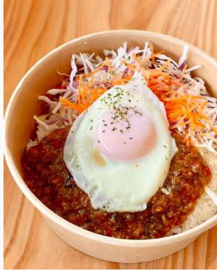
Gapao rice ¥1,350

Made with 100% A5 ranked Wagyu beef. Loco moco bowl made with hamburger steak and plenty of vegetables. The garlic soy sauce is addictive and the most popular menu item.