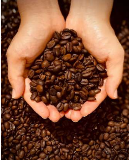
Yambaru Coffee ¥650

We purchase beans from coffee shops that roast coffee in Okinawa on a daily basis, We grind the beans after receiving your order. You can also have a latte for 100 yen extra.