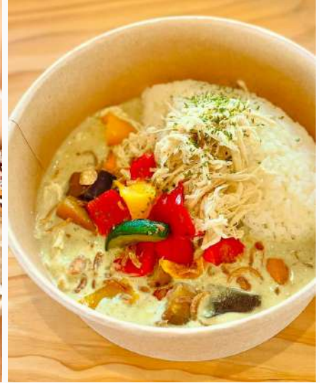
Green curry ¥1,350

Chiang Mai's rich and full-bodied Gapao Rice with Holy Basil and spices. The special fish sauce is the key to the flavor.