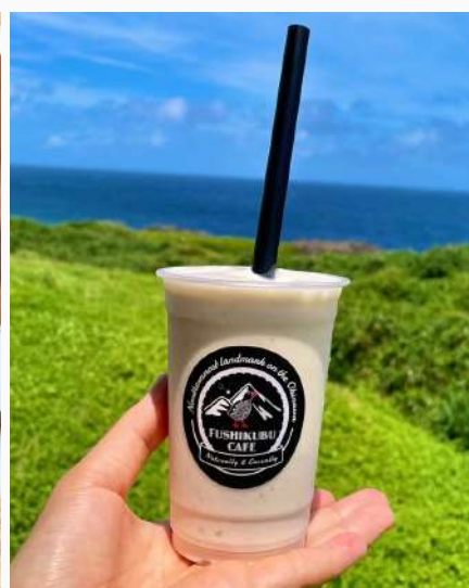
Apple Banana Shake ¥750

Basque cheesecake from El Camino, a Spanish restaurant with fans nationwide. Served with Spanish rose salt.