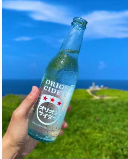
ORION CIDER ¥600

We purchase beans from coffee shops that roast coffee in Okinawa on a daily basis, We grind the beans after receiving your order. You can also have a latte for 100 yen extra.