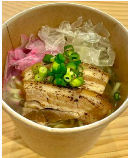
Okinawa' n Noodle ¥1,000

Salad wrap with lots of vegetables. Taco Meat - Caesar Chicken - Ham & Cheese Choose from three types of salad wraps. Soup set is recommended.