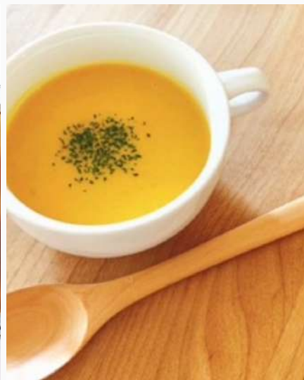
Set soup +¥300

A special set of soup of the day. Soup by itself is 500 yen.