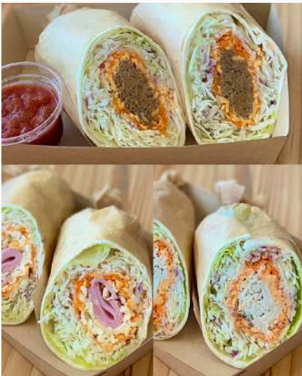
SALAD WRAP ¥1,000

Authentic Thai-style green curry. It is made quite mild with coconut milk, but it is quite spicy, so be careful if you don't like it or if you are a child!