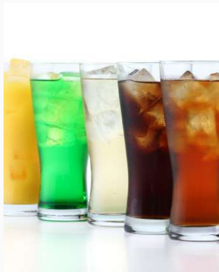
Set Soda fountain +¥400 Free refills