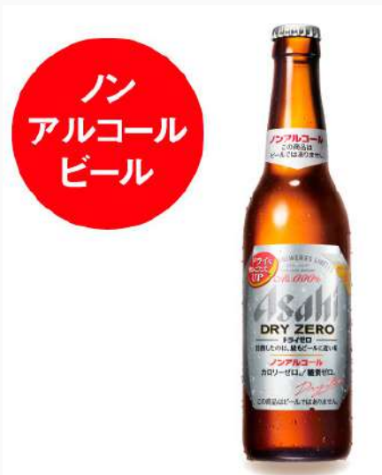
alcohol-free beer ¥600

Free refills! wild grape squash, calpico, coca-cola, shikwasa soda, and Green tea. We use environmentally friendly butterfly cups.