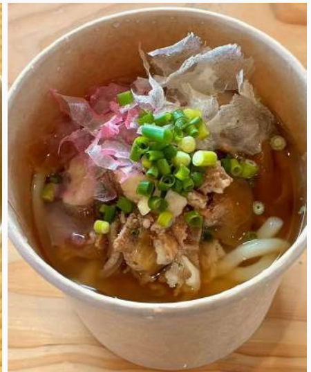
udon noodles with pork ¥1,000

Tender seared tripe and red and white shaved fish cake are pleasing to the eye. The noodles are Yanbaru aged noodles. Red ginger, kohlrabi sauce, and shichimi (seven spices) are optional.