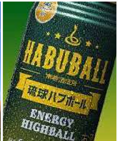
Okinawa Energy Cocktail ¥700

Craft beers made in Okinawa are carefully selected according to the season.