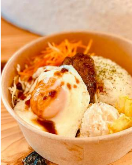
Loco mco bowl ¥1,550

Made with 100% A5 ranked Wagyu beef. Loco moco bowl made with hamburger steak and plenty of vegetables. The garlic soy sauce is addictive and the most popular menu item.