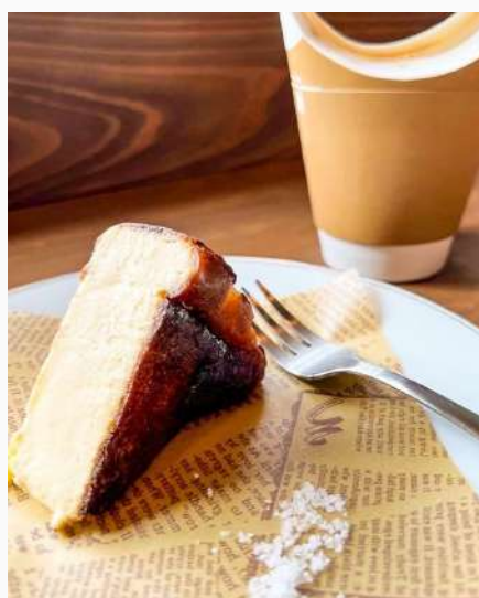
Basque cheesecake ¥900

Contest-winning pastry chefs create gelato with the utmost care.